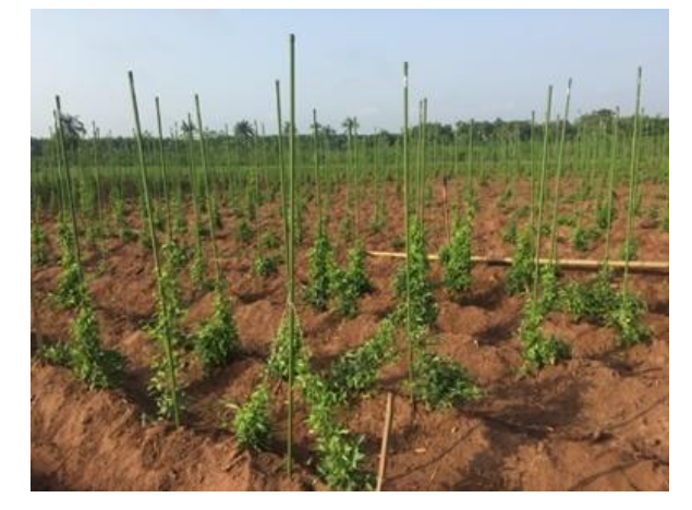
Plate 1. AYB plants growing in the field