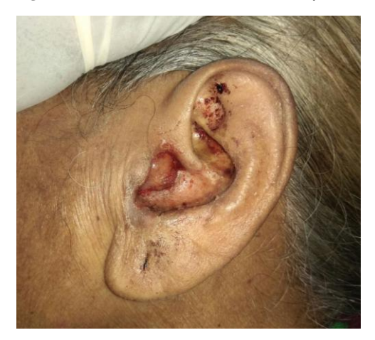
Figure 2. Aural polyp