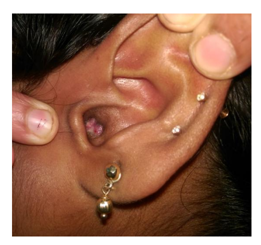
Figure 1. Granulation tissue in external auditory canal