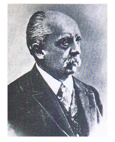
Hermann Ludwig Ferdinand Helmholtz, who made the inner eye visible to ophthalmologists

Helmholtz explained the mechanism of accommodation of the eye and perception of color [5]. This went unchallenged until the final decade of 20th century.