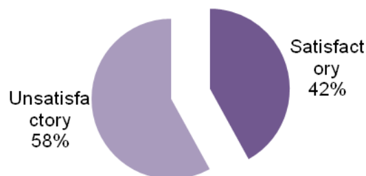
Figure 1. Participants' level of knowledge regarding cervical and breast cancer (n=215)

Regarding study sample correct knowledge about cervical cancer, 67.9% and 61.4% respectively considering sexual disease and oral contraceptive risk factors while less than half(49.8%) considered papillomavirus. 59.1% reported bleeding as danger sign whereas pelvic pain reported by 48.4%. only 21.9% Know HPV vaccine however 64.7% believed that pap test help in cervical cancer early detection (Table 3).