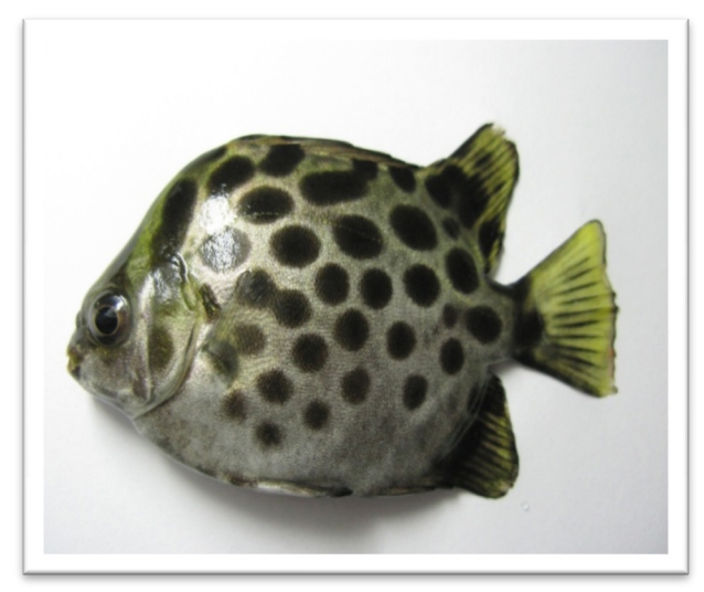
Figure 1. Scatophagus argus