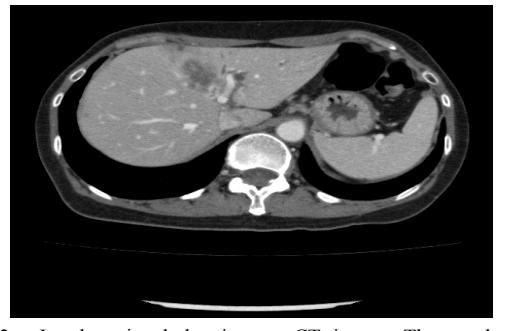
Figure 2. Intrahepatic cholangiogram CT image: The quadrate lobe contains a mass. Peripheral enhancement of the tumour and peripheral bile duct dilatation are shown

magnetic resonance cholalangiography (MRCP) defines the anatomical location of the tumour and combined with magnetic resonance angiography assesses contralateral vascular involvement.[3,4] Positron emission tomography (PET) would detect unsuspected distant or intrahepatic metastases in up to 30% of patients with cholangiocarcinoma. Endoscopic retrograde cholangiopancreatography [3] (ERCP) may assess the extent of distal cholangiocarcinoma and achieve biliary stenting. Percutaneous transhepatic cholangiography (PTC) is necessary for hilarcholangiocarci nomas to delineate anatomy and achieve external drainage. [3,4] Bilateral drains are required if right and left ducts are disconnected. Although routine preoperative biliary drainage increase risk of postoperative infective complications, it is performed prior to extended liver resection, or if there is cholangitis or renal failure.[4,21]