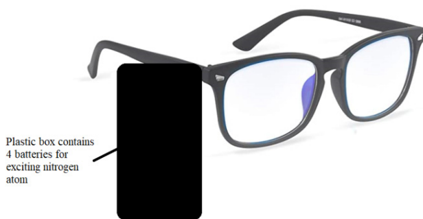
Figure 4. Glasses & Goggles of time travel

The exciting of the 1 st electron of nitrogen atom to return back in orbit to the past or go forward in orbit to the future or even travel through time to the present time.