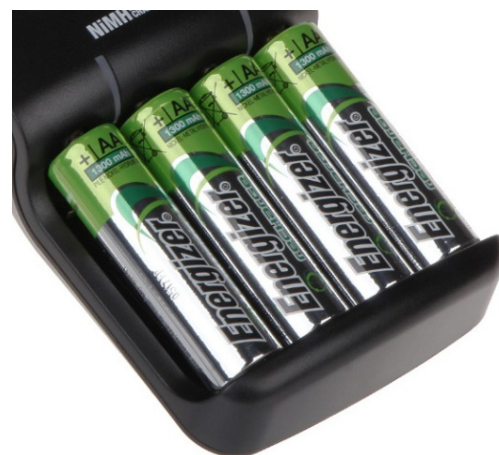
Figure 5. The way we should put batteries in the battery box

The batteries should be put in the plastic box like they are put in a device not it is put randomly (see Figure 5).