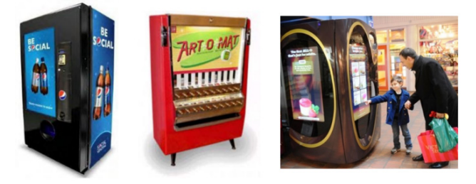
Figure 1. Vending machine kinds

2. Consumers are now buying higher-priced goods from vending. Consumers are showing a willingness to buy a wide range of goods and services from vending machines or remotely attended retail, including general merchandise, electronics, fashion, beauty, flowers, gifts, prescriptions, investments, even gold bars and kitchens. Millennial generation shoppers, in particular, are often more comfortable buying from machines than from humans, who may be perceived as slower and less accurate.