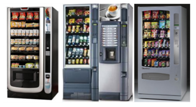
Figure 2. Sample types

In this research, with the aims of expanding pleasure practical implication in products, 2 stages were followed: library survey & reference extraction of the related articles from the definition of research review & previous reports, second stage that was done in a cross-sectional and case study. In this research, home appliances of Iranian companies were analyzed. Three types of 3 distinct products were selected as case studies that are presented in Fig. 2, Fig. 3. After that a questionnaire was designed that was filled by 15 women with 20-60 years old. Interviewee's perceptions through presenting product sampling were evaluated by content analysis and semantic differences scale. In this way, housewives evaluated each product separately. The aim was to gather housewife comments about products (mixer, iron, rice cooker) and evaluate their pleasure in using products.