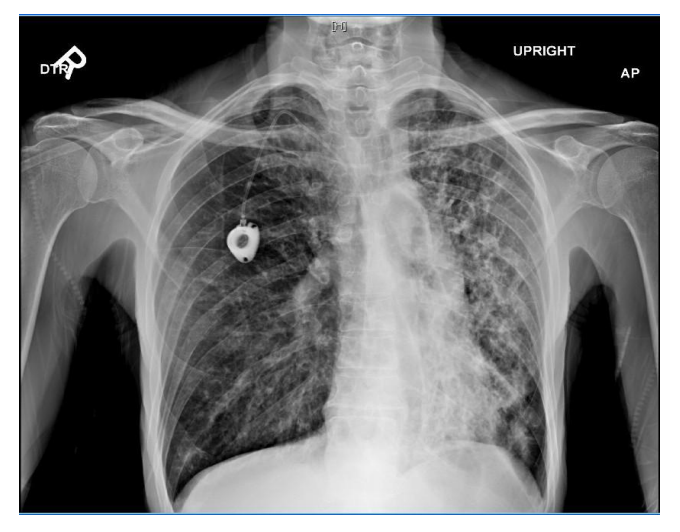
Figure 1. Chest X ray showing bilateral diffuse reticulonodular opacities and central bronchiectasis

previously, he was seen by a Pulmonologist at Detroit medical center, Michigan for recurrent productive cough, which was associated with weight loss and shortness of breath. His physical examination was significant for digital clubbing, prolonged expiratory phase and a wide spread rhonchi.