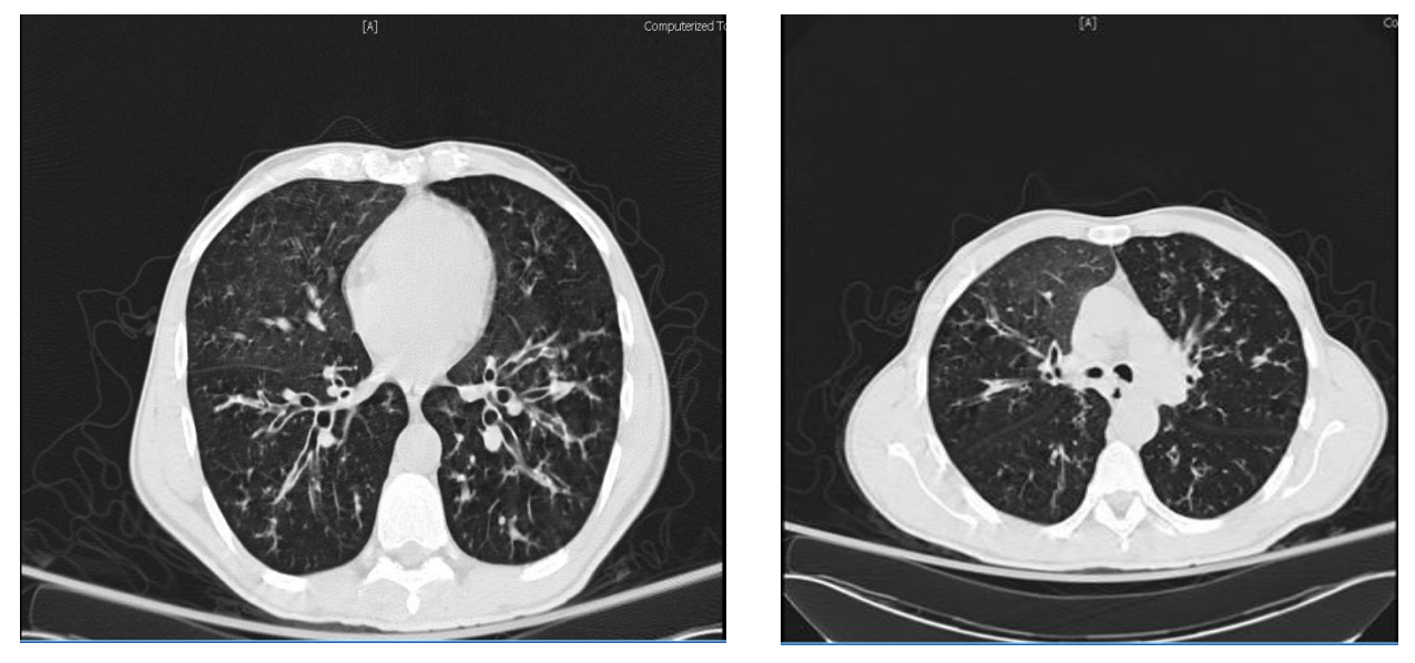
Figure 2. CT scan showing bronchiectasis, interstitial thickness and fibrosis