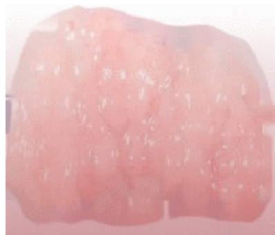
Figure 1. Removed mass

Transurethral Resection of Bladder tumour (TURBT) was adopted on 3 May, 2012 to remove the mass, shown in figure 1. Patient was stable after procedure. However, he complained a suprapubic pain and hematuria. Bladder irrigation was performed to prevent the clot formation and bladder washing. Hemoglobin and hematocrit value was lower than normal that was covered by blood transfusion.