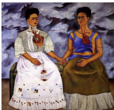
Figure (1). Title: Two Frida (1939) Technique: Oil on canvas (5/173- 173 cm). https://www.google.com# image& Frida kahlo