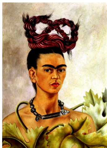
Figure (3). Name of work: paintings, with their wigs (1941) Technique: oil on hard fiber (7/38-51). https://www.google.com# image& Frida kahlo