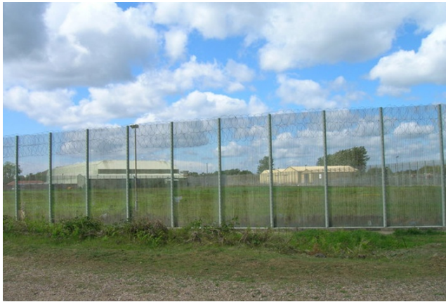
Figure 4. JThomas, “Perimeter fence, Linholme Prison” uploaded on geograph.org.uk on the 22/05/2011, Creative Common License, http://www.geograph.org.uk/photo/2422162

Architecturally, a prison is not what one would describe as pleasant. Its design is ultimately to house prisoners and stop unauthorised persons getting in or out. In order to achieve this, prison fence systems are large and intimidating without apology; these often are cost effective and not too elaborated solution. They typically feature chain mesh and barbed wire and allow views inside the prison to buildings that are harsh and strong in construction.