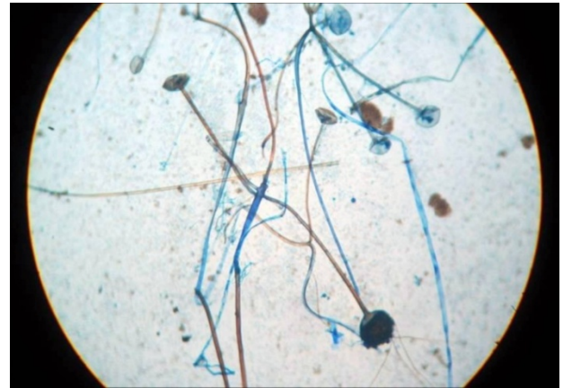
Figure 5. Showing rhizopus

Diagnostic nasal endoscopy revealed mucopus in the middle meatus. No polyps or growth were seen in the nasal cavity. A swab taken from the palatal ulcer was suggestive of infection with rhizopus species. (Fig.no.5)