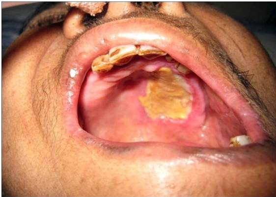
Figure 2. Showing necrotic patch over the hard palate

the ENT, Ophthalmology and neurology examination was normal.