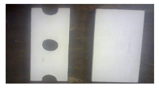
Figure 4. Calcium Silicate Board after Cutting

A method of manufacturing a lightweight calcium silicate board using the Hatschek sheet machine process comprises of primary curing and thereafter hydrothermally reacted in a pressure vessel which is compact. The Calcium Silicate board was purchased from Ramco Hilux, Jaferkhanpet .