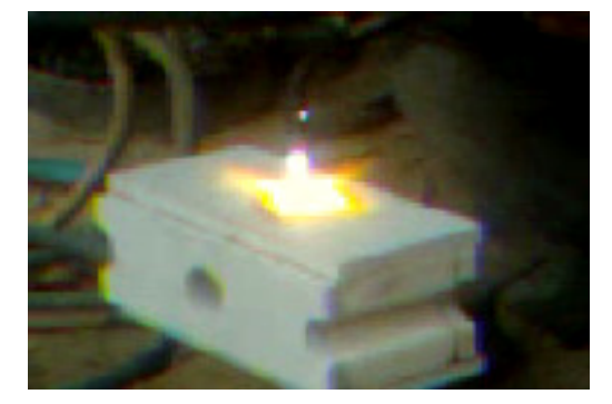
Figure 16. Brick during Fire Test into Position