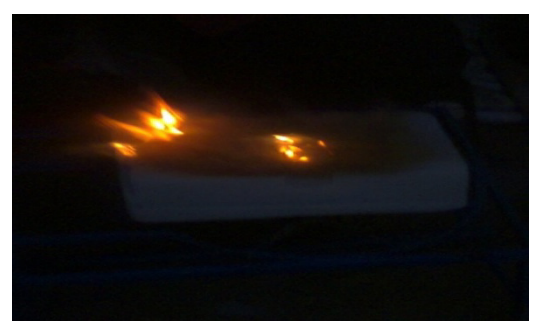
Figure 19. PIR Foam during Test