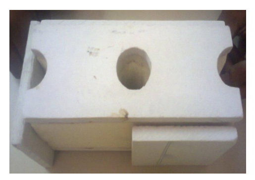
Figure 9. Corner Bricks - Left Side (Type 4)