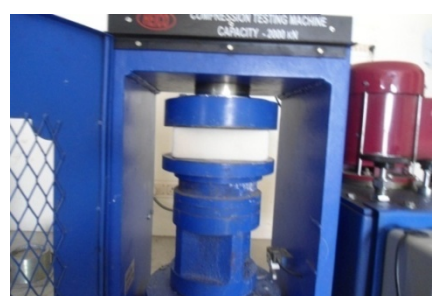
Figure 21. Foam in Compression Test

Compressive strength tests on the modified sample were carried out. Whole block tests returned the results above, that is, 380kPa. The stress/strain relationship is linear up to the yield point where collapse of the test specimen occurs. This yield point sets the maximum strength of the block. The stress/strain curve shows an initial set of approximately 1mm under test conditions. This suggests that there is a "bedding in" process when loads are applied through the platens. This condition will apply in wall building and a small pre-compression load should be applied through the top wall plate.