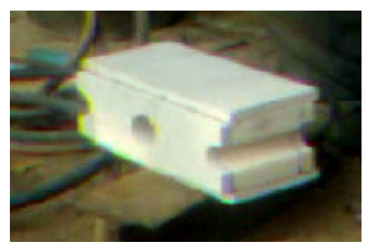
Figure 15. Green Enery Bricks Set

The Calcium Silicate Board did not catch fire, ignite or was penetrated in any way by the flame. A 2mm diameter mark was left on the Calcium Silicate Board where the most intense heat of the middle of the flame was situated. When left to cool down after the flame was extinguished the 2mm diameter area was scraped back using a sharp tool to find it only penetrated 2mm into the board and only at the very centre where the flame had been.