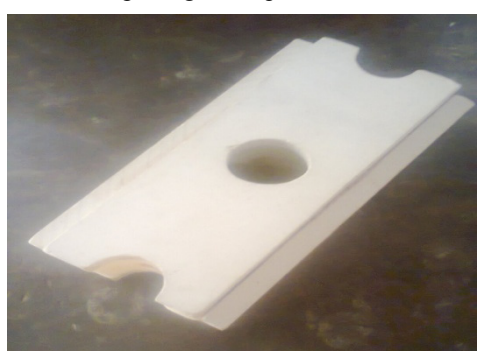
Figure 6. Full Sized Green Energy Bricks (Type 1)

Each Full sized Energy Brick is 190mm long and 90mm wide (including the Calcium Silicate Board on the internal and external surfaces). Each Half brick is 95mm long. If the external dimensions of building are in multiples of 300mm there will be no need to cut any bricks. But Deduction for the window and door openings is required.