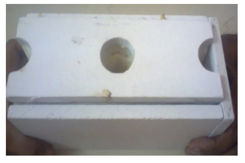
Figure 10. Bricks for Openings - Full (Type 5)