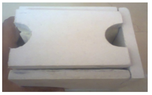
Figure 11. Bricks for Openings - Half (Type 6)