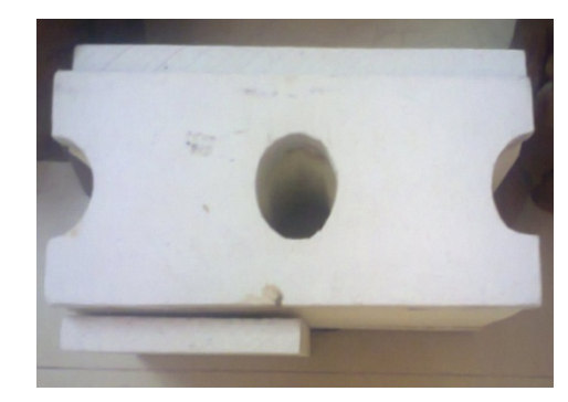
Figure 13. Bricks for T-Junctions – Left Side (Type 8)