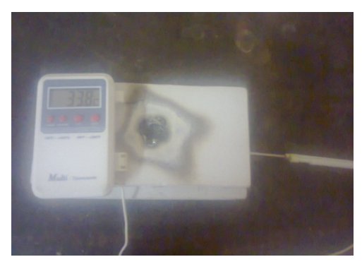
Figure 24. Temperature Sensor on the Interior Face