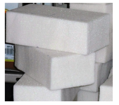
Figure 3. Foam after Cutting into Brick Size

greater chemical bond also makes it difficult to break, which results in a stable PIR foam in both the properties of chemistry and thermal effect. The PIR foam was purchased from Shree Venus Energy Systems, Perumbakkam .