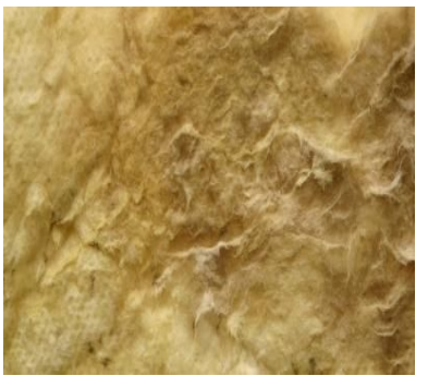
Figure 1. PIR Foam Paste

At elevated temperatures, Methylene diphenyl di-isocyanate (MDI) in excess reacts with itself forming a highly cross-linked thermosetting complex polymer with a ring-like structure which means difficult to break and have high density. This MDI reaction will result in the compound named tri-isocyanate isocyanurate.