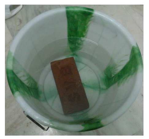
Figure 26. Conventional Bricks Immersed in Water

The weight of the conventional brick before immersing in water was found to be 2.914 Kg and the weight of brick after immersing in water for 24 hours was 3.178 Kg. From the weights observed before and after immersing, the water absorption of the conventional bricks was found to be 9.05%.