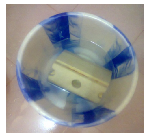
Figure 25. Green Energy Bricks Immersed in Water

The weight of the Energy Brick before immersing in water was found to be 0.620 Kg, and the weight of brick after immersing in water for 24 hours it was 0.629Kg. From the weights observed before and after immersing, the water absorption of the Energy Bricks was found to be 1.45%.