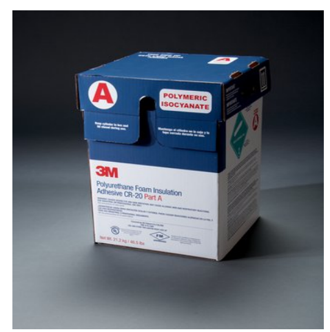
Figure 5. CR 20 adhesive

calcium silicate board. After which the board is placed onto the PIR foam. Once the adhesive is applied, chemical curing takes place for several minutes depending on temperature and weather conditions.