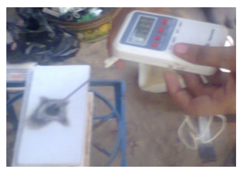
Figure 23. Temperature Sensor on the Exterior Face

The exposed side of the Energy Brick reached 900°C. The temperature loggers, which were placed on the opposite face of the Energy Brick wall, indicated an average temperature of only 28°C, with the highest temperature recorded at only 40°C. The extreme heat on the exposed Energy Bricks was not transferred through the Bricks. This clearly indicates the Energy Bricks' thermal resistance in extreme heat. An important observation to note is that the heat source did not have an effect on the Energy Bricks until after 10 minutes had elapsed, when temperatures had reached 700°C. After 25 minutes, the temperatures on the unexposed face began to be consistent at the average temperature of 28°C, even though the temperature on the exposed face was still steadily climbing beyond 830°C. Similar thermal resistance can be expected in regard to the Energy Bricks' exposure to extreme cold.