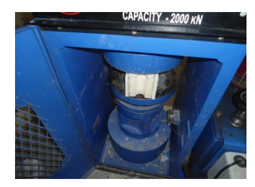
Figure 22. Brick in Compression Test

It is found that green energy bricks have high compression strength which can be used as structural element in any buildings. Further it has elasticity properties which means that central core of green energy bricks have the properties of regaining its original size after the removal of application of load. Green energy bricks will get more strength in practical than we tested in laboratory due to high insulation properties of it. This explains that it will get more strength due to wind action and threaded steel rod running vertical through it.