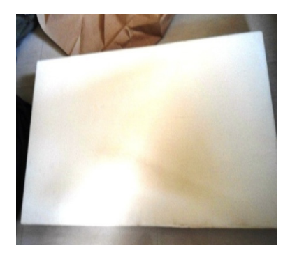
Figure 2. PIR Foam

The remaining MDI and polyol is mixed with tri-isocyanate which finally forms polymer of isocyanurate. This isocyanurate polymer has a comparatively strong molecular structure, because of the existence of strong chemical bonds contributing to the greater strength. The