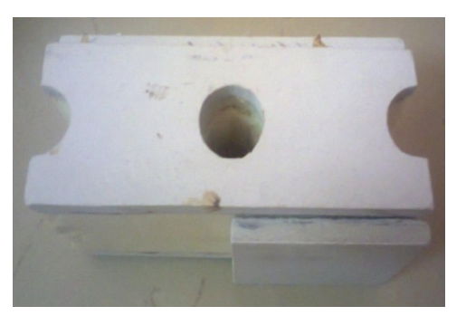
Figure 12. Bricks for T-Junctions – Right Side (Type 7)