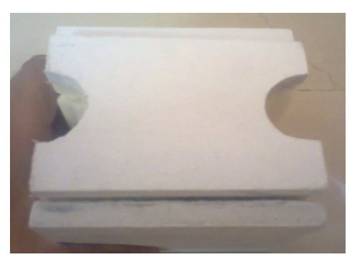
Figure 7. Half Sized Green Enrgy Bricks (Type 2)

A type 3 brick is used for corner in any building construction. Half sized calcium silicate board is used in longitudinal face and also in transverse face.