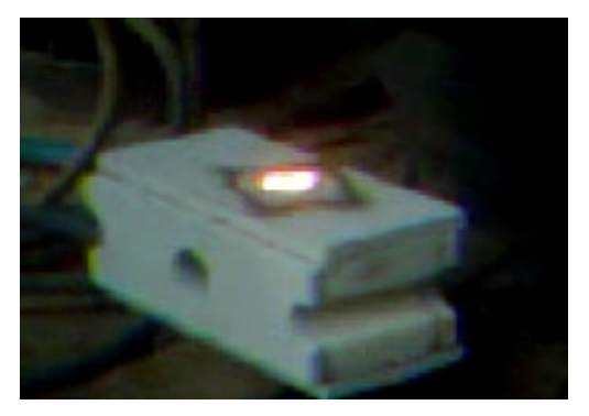
Figure 17. Brick after Fire Test