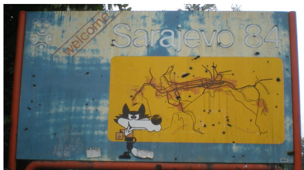
Figure 2. Welcome to Sarajevo Sign for the 1984 Winter Olympics outside the train station with noticeable bullet holes