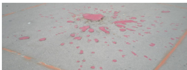
Figure 4. A 'Red Rose' marks the pavement