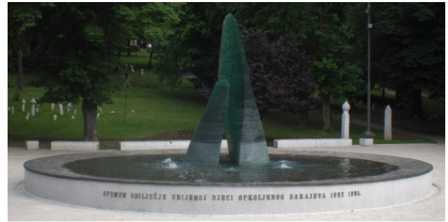
Figure 1. Memorial dedicated to the Bosnian War and siege in Sarajevo, 1992–1995, located outside Veliki Park