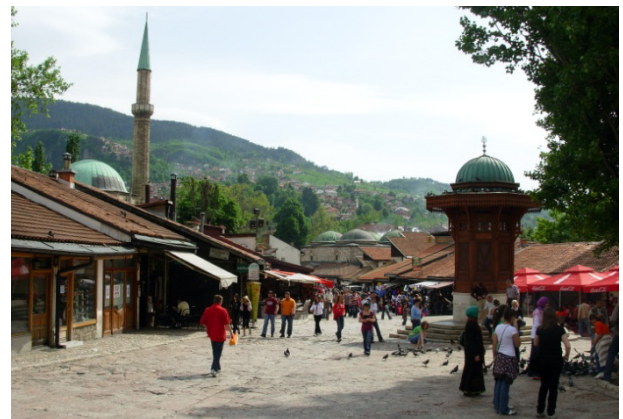
Figure 7. Bazaar District in Sarajevo where it is common to find war paraphernalia

Artefacts, such as war paraphernalia, have become a part of the new tourism narrative and attraction. In some ways this refers to the commodification of the war materials, but as discussed in article above, such souvenirs became an inherent part of the visitor experience—as tourists made their way through Sarajevo's Baščaršija (Bazaar).