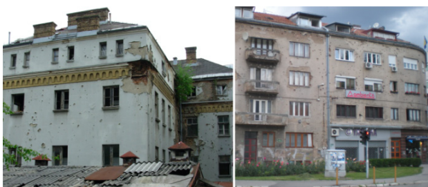
Figure 3. Bullet holes and the scars of war noticeable in the façades of buildings