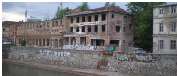
Figure 5. Buildings that were burnt out and never restored along the Miljacka River