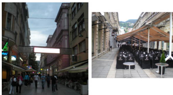
Figure 6. Elements of cosmopolitanism in central Sarajevo along the Ferhadija

There has been much communicated about Sarajevo that positions how war remains a central component of the discourse, for instance: