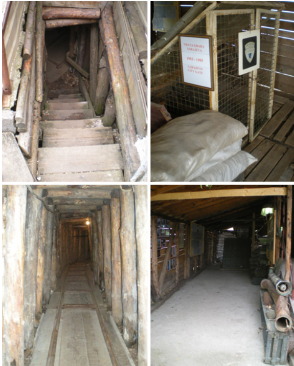
Figure 8. Images from the Tunnel Museum

Following the war and once Sarajevo’s international airport was rebuilt most of the tunnel was lost. However, 25 meters did remain intact and one-year following the war where this intact stretch remains (Figure 8), the family whose home where the tunnel enters opened the ‘Tunnel Museum’ ( Naniamo Daily News 16 August 2008). The tunnel museum relates to two of Foote’s conceptualizations, sanctification and designation [28]. It is an attraction that brings visitors into the experiences of war and survival during the siege of the city. It is clearly a designated site where goods and supplies (i.e. food and ammunition) were brought from the free Bosnian territory into the city that was surrounded. In another regard, this site can be interpreted as sanctification, because it is a site of remembrance that has a lasting meaning to locals and to visitors who seek such attractions.