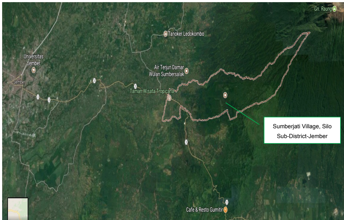
Figure 2. Research Location Map

Location of the study can be seen in the map below.