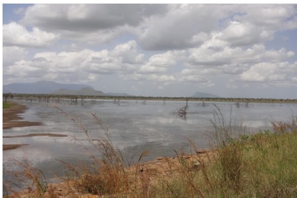
Figure 2. Nakicumet dam in Napak District