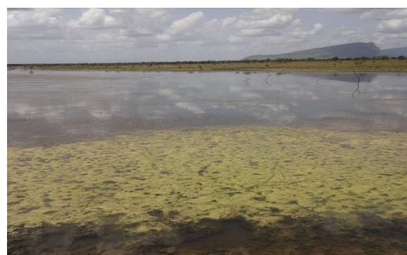
Figure 9. A greeny water weed blooming in Nakicumet dam