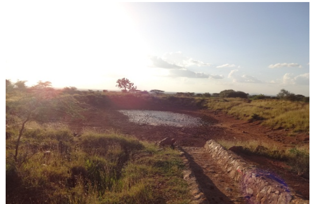
Figure 3. Lomario dam in Rupa, Moroto district