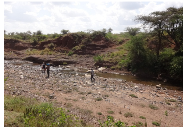
Figure 4. River Moroto as seen from Moroto district