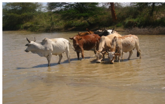
Figure 8. Direct watering of livestock in Lomogol dam in Kotido District