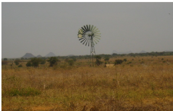
Figure 1. Lotome windmill in Napak District

Six sources of water exist in Karamoja for livestock depending on season and type of livestock. Boreholes, wind mills (Figure 1) and ponds fall in the first category of water sources utilized mainly to water small stock (goats, sheep and donkeys) mainly by small herders. Goats and sheep watered in these facilities are mainly those that remain within the manayattas. Valley tanks, dams (Figure 2 and 3) and rivers (Figure 4) and river beds provide the second category of water sources for livestock in Karamoja (Plates 1-4). Rivers are mainly utilized during rains while during desperate periods, river bed sand dugout wells are utilized to water livestock in the major rivers. Dams have proven to be useful sources of water for livestock; in Moroto and Napak; Kobebe and Nakicumet dams respectively have proven most important dams. Since their construction, these dams have barely dried. They have thus become convergence points for livestock when the water scarcity problem intensifies in the surrounding districts. Kobebe dam for example hosts the Matheniko and some Tepeth pastoral communities from Rupa sub-county and slopes of mountain Moroto respectively located in Moroto District, Jie pastoral community from Kotido District and Turkana pastoralists from Kenya while Nakicumet dam provides for the Bokora and the Pian pastoral communities from Napak and Nakapiripirit (particularly those from around Lorengdwat and Nabilatuk sub-counties) respectively.