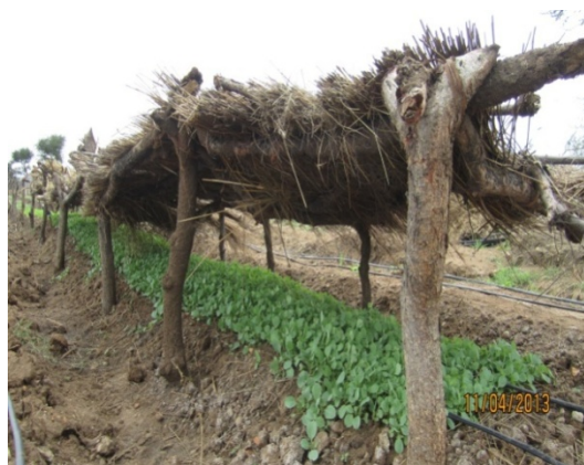
Figure 7. A seed bed of vegetables awaiting transplanting