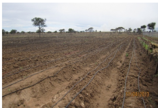
Figure 6. Prepared gardens laid with drip irrigation pipes at Nakicumet