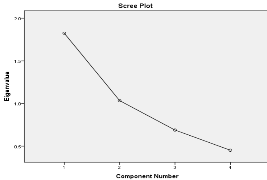
Figure 2. Factor Analysis for Category of Immigration to Physical Activity Change