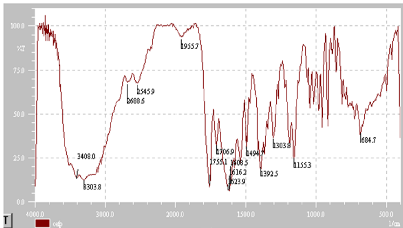
Figure 2. Infrared spectrum for ceftazidime reference substance

Calibration curve of ceftazidime was obtained by plotting absorbance measurements against drug concentration. The curve was linear at range 0.5-7.0 mg, with a regression coefficient of 0.9998 and a linear regression equation of y = 0.1717x + 0.2129 (Figure 3).