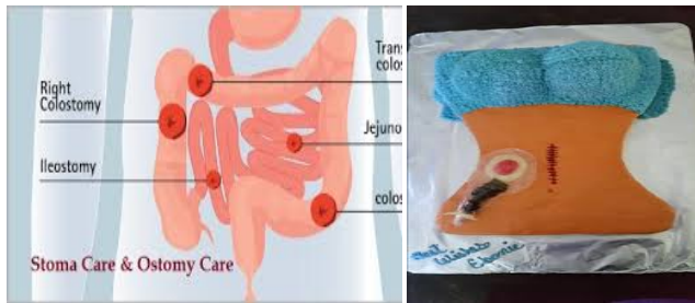
Figure 1. (Sun et al, 2018)

management of huge, metastatic disease or for emergencies such as perforation or obstructions. In 90% of low-mid rectal cancers, an anastomosis is accompanied by a temporary ("protective") diverting ileostomy; this is later reversed in a second surgery [3]. A temporary ostomy allows the anastomosis to heal, and prevents catastrophic complications. In some cases, temporary ostomies may become permanent long-term as a result of chief co-morbidities and complications, such as anastomotic leaks or strictures. The treatment decision making method for ostomy surgery is complex. (Fig 1) [4].