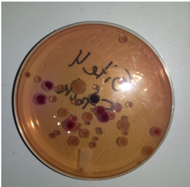
Figure 4. Salmonella and Shigella on SS agar

Since the fecal coliform level was alarmingly high during the month of October, test for presence of patogenic organisms such as Salmonella and Shigella were carried out on SS agar media (Figure 4). This is a selective and differential medium used in isolating enteric pathogens from