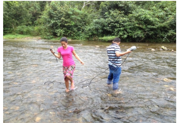
Figure 2. The Dry Creek (Site 2) During Wet Season

Temperature ( °C ), Dissolved Oxygen (mg/L), pH, conductivity (ms/cm), Turbidity (FTU), Nitrate (mg/L), Phosphate (mg/L) and Total Chlorine (mg/L).