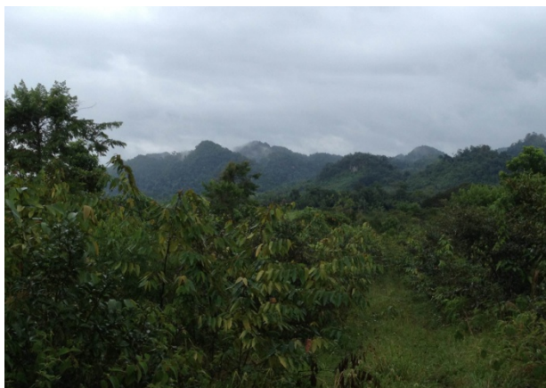
Figure 1. The Maya Mountain – The Main Watershed of Sibun River