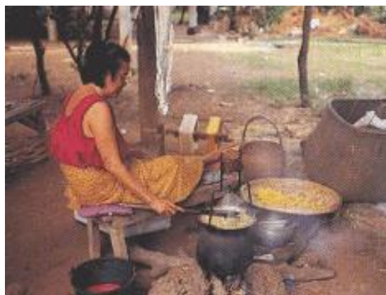
Figure 1. Hand silk reeling

process. Silk reeling machine was shown in Figure 2. It was driven by electric motor.