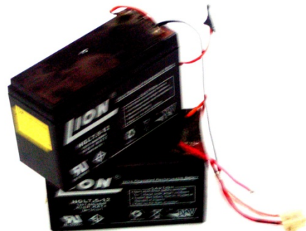
Figure 6. Dry cell