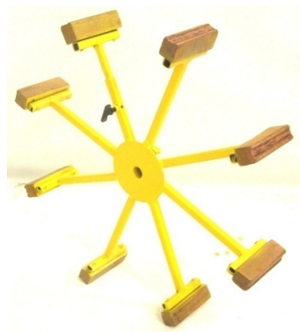
Figure 7. Spinning wheel