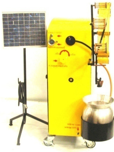
Figure 3. Silk reeling machine powered by solar energy

The silk reeling machine powered by solar energy (show in Figure 3) consists of solar cell, silk reeling machine and boiler. The boiler was powered by Liquefied Petroleum Gas (LPG), show in Figure 4. The charger was shown in Figure 5, it was used to charge the rechargeable battery (Dry cell). The dry cell was shown in Figure 6. The spinning wheel was shown in Figure 7, it was used to spin a silk. And it was powered by the DC motor. The DC motor was shown in Figure 8. Solar cell was shown in Figure 9, it was used to produce direct current electricity from the sun light.