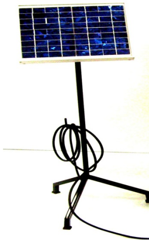
Figure 9. Solar cell