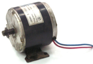
Figure 8. DC motor