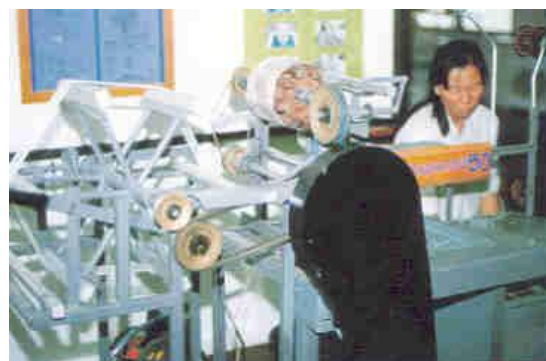
Figure 2. UB2 silk reeling machine