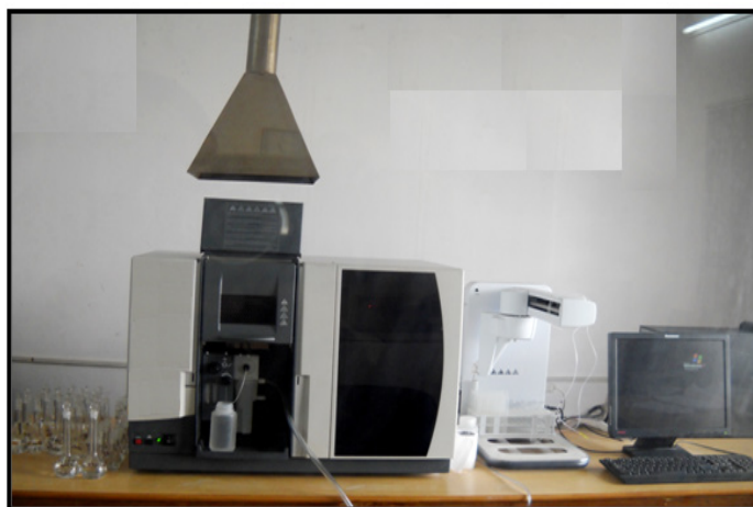
Figure 2. An atomic absorption spectrophotometer instrument in the laboratory