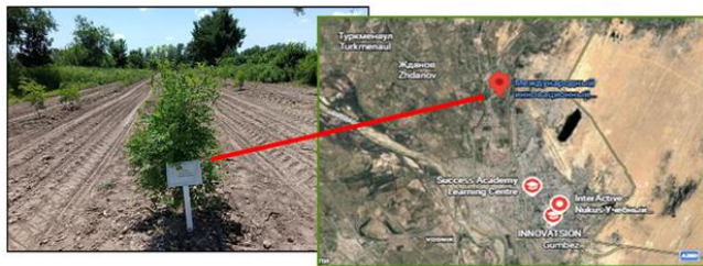
Figure 1. Experimental field of Ziziphus jujuba Mill. in the Aral Sea International Innovation Center, with geographical location indicated on the map

The object of our research was the species Ziziphus jujuba Mill., introduced to the Republic of Karakalpakstan, and the varieties ‘Ta-yan-szao’, ‘U-sin-xun’, and ‘small-fruited cultivar’ with fruits. Our experiments were mainly conducted at the Aral Sea International Innovation Center under the Ministry of Ecology, Environmental Protection and Climate Change of the Republic of Uzbekistan, in the Amudaryya district and the city of Nukus. The research work was carried out during 2023–2025 (Figure 1).