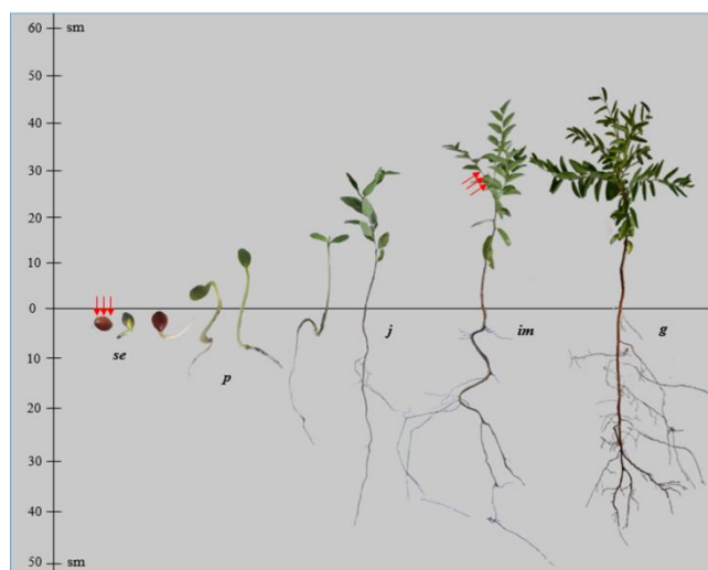
Figure 5. se – latent period, p – grass stage, j – juvenile stage, im – immature stage, g – generative period

This stage includes the period from the appearance of the first order branches in the plant to the budding stage. In Z. jujuba , this stage was observed 46 days after seed germination, in the third decade of May. The first order branches emerged mainly from the 4-5-6 pairs of pinnate leaflets. The height of the plants was 20-23 cm at the end of June. The number of lateral branches was 13-17, the length of the lower ones was 16-18 cm, the branches in the middle part were 19-22 cm, and the length of the upper branches was 11-15 cm. There are fourth-order branches. The length of the leaf plate is 3.1-3.3 cm, width is 2.2-2.4 cm, the spines consist of 1 pair in each leaflet, the length is 0.5-0.9 cm. The root system is well developed, has a fourth-order branching, the main root is 27-32 cm, deep, the most formed roots are 2-3 orders. The immature stage was noted to last 51-56 days (Figure 5).