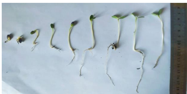
Figure 3. The grass stage ( p ) of Ziziphus jujuba morphogenesis

the formation of the first pair of true leaves. According to the results obtained, it was found that scarified seeds of Z. jujube germinate 10-11 days after spring sowing, while stratified seeds germinate 21-26 days, and some even later. When the seed first begins to germinate, the seed coat slightly enlarges and splits. Initially, the hypocotyl emerges from it to the surface. When the seed germinates, the hypocotyl is curled, light green in color, and the cotyledon leaves bring the seed post to the surface. After germination, the cotyledons on the 3rd day are not yet fully opened and are located close to each other. During this period, the hypocotyl is short and curved, and the root is just forming, and the initial growth of the main root is observed. The seedling is generally morphologically thin and poorly developed, and is characterized by small seed pod sizes (Figure 3).