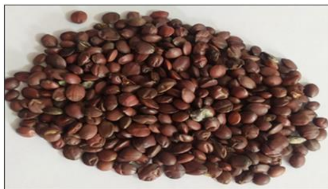
Figure 2. Latent ( se ) dormancy period of Ziziphus jujuba Mill. Morphogenesis

This period is the intermediate period from the moment the plant seeds ripen to germination. The fruits of Ziziphus jujuba are drupes with a hard endocarp. Usually 1, sometimes 2 seeds develop inside the fruit. The seeds are endospermic. The seeds of Ziziphus jujuba are brown, oblong, hard, oval or flat, consisting of 1–2 elliptical seeds, 8–9 mm long and 4.8–5 mm wide. The weight of 1000 seeds of the Z. jujuba plant is 204.55 grams. The average weight of one seed was measured in laboratory conditions on an electronic balance (KERN 440–45N). Seed weight is of great importance: large and heavy seeds have high sowing quality [12]. Seed weight is essential for determining planting standards. The latent period is determined by the development of the fertilized egg, embryo formation, and seed maturation. During this period, nutrients necessary for the further development of the plant are accumulated in the seed coat. Seed formation is a complex biological and physiological process that depends on environmental factors and the speed of pollination and fertilization (Figure 2).