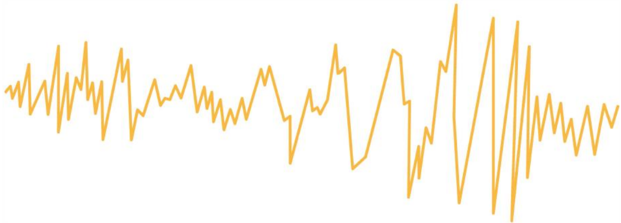
Illustration: ©Johan Jarnestad/The Royal Swedish Academy of Sciences