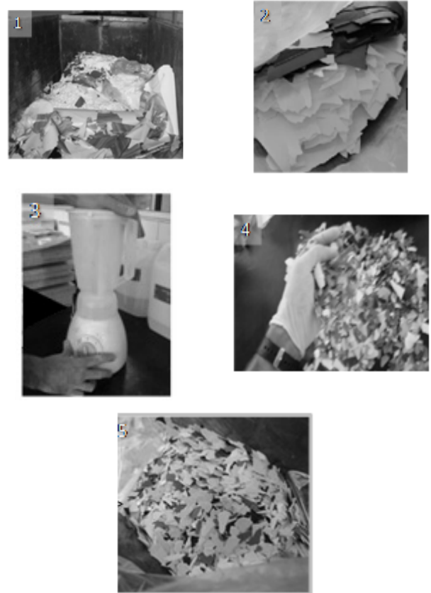
Figure 1. Preparation of IPW in particles

The experimental results were statistically evaluated across an analysis of variance using Tukey method with 95% confidence level, by the Minitab r16 software.