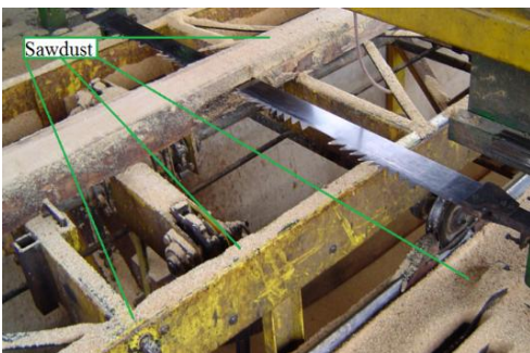
Figure 6. Sawdust generated on the different points of machine elements