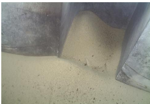
Figure 5. Sawdust generated by process with Pica-Pau type machine on the compartment for collecting

From the qualitative analysis, the residues generated in the processing machine Pica-Pau type are mostly saw dust. The sawdust was deposited in a special compartment for collecting the residue (Fig. 5) or on the different points of machine elements (Fig. 6).