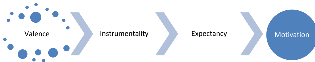
Figure 2. The motivated equation (Vroom, 2000)

Vroom suggests that motivation, expectancy, instrumentality, and valence are highly related one to another. Therefore, it is very important for leaders to consider these elements in order to maintain a motivated staff.