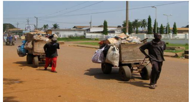
Figure 3. Informal waste workers carting collected waste

substances from the light industrial areas are all picked together, thus increasing the risk of infections.