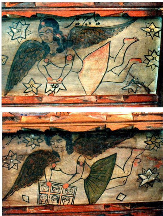
Figure 20. The Angel of Death Angel while human beings are near death and the angle is taking the revelation letter, Gavan kola Saqanefar, Babol city