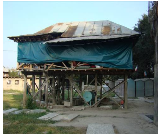
Figure 6. Ahangar kola Saqanefar in Amol city

This Saqanefar Village is located in Ahangar kola village in Amol (Fig. 6). The length and width of Saqanefar is 9×3 m. materials used in the two-storey building are entirely made of wood and its main entrance is from the north side. It also includes wood work and woodcarving decorations on the gabled ceiling margins[14].