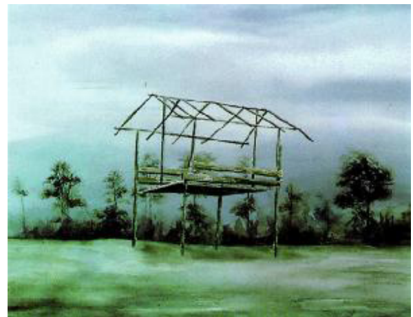
Scheme 1. Nepar in Mazandaran

Saqanefar broad constructions in Mazandaran are connected to a series of historical events in early years of Islam and the religious and political developments in Iran and Mazandaran. Alborz natural shield prevented the Arabs from Mazandaran premature conquering and Islam could not enter Mazandaran till the early of the second century hegira[3]. After the arrival of Islam in Mazandaran, religious and political developments in Mazandaran were slightly different than other regions of Iran. Three historical events led to the rise of Shiites in Mazandaran earlier than