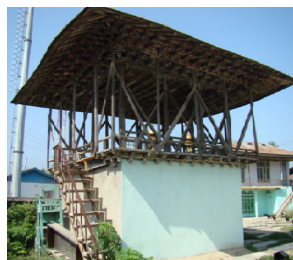
Figure 3. Pasha Kola Saqanefar in Amol city

The Saqanefar is located in Pasha kola Village in Amol city (Figure 3). Its approximate length and width is 4×5 m. it is a two-storey building. The ground floor is made of brick and the second floor is entirely made of wood. The Saqanefar