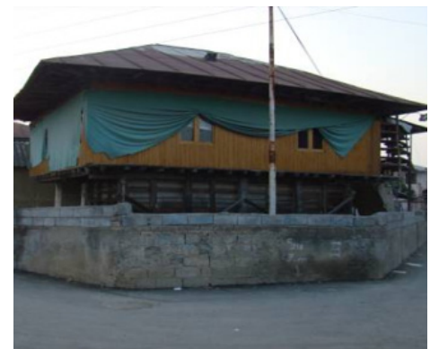
Figures 16. Western Darka Posht Saqanefar in Amol city