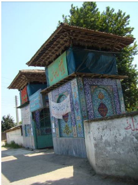
Figure 5. Hendou Kola Saqanefar in Amol city

It is located in the Hendou Kala village in Amol city (Figure 5). It is approximately 2.5×2.5 m in length and width. It is located on both sides of the cemetery entrance of the village.