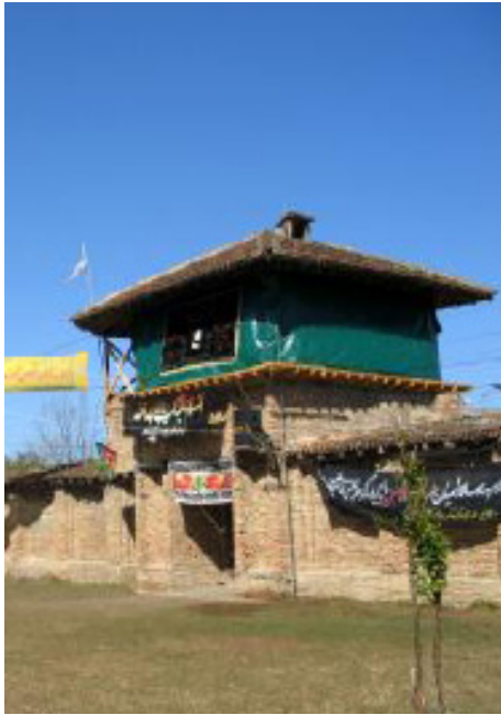
Figure 8. Moqri Kola Saqanefar in Babol city

It is located in Moqri Kola village in Babol city (Fig. 8) [15]. It is approximately 4×3.5 m in length and width. This Saqanefar along with two other Saqanefars has been built beside the Moqri Kola mourning place. the ground floor has been made of brick and the second floor has been made of wood. The building also has a ridge.