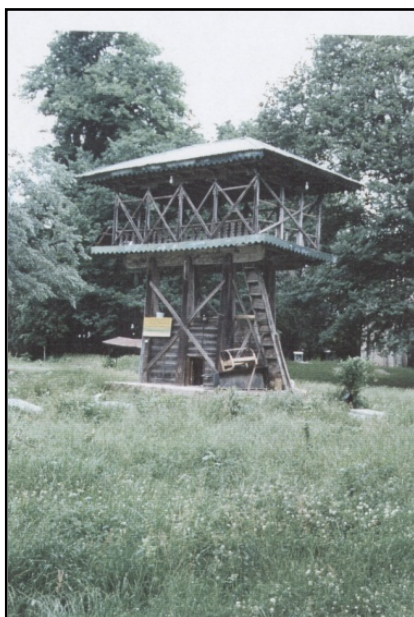
Figure 1. Kachal Deh Saqanefar in Nour city

The Saqanefar is located in Kachal Deh village of Nour city (Fig. 1)[12]. It is approximately 3×2.5 m in length and width. This is a two- storey monument which is entirely made of wood. It has a gabled ceiling and woodwork and woodcarving techniques on the ceiling have been used as decoration in these Saqanefars.