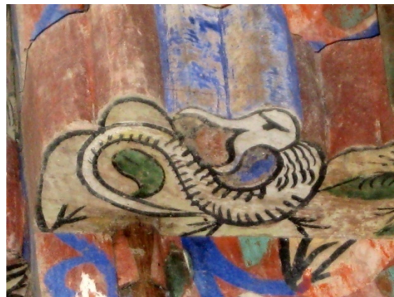
Figure 22. Image of Dragon, Seyyed Mahale Shia Deh Saqanefar, Babol city