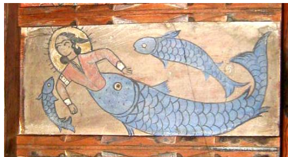
Figure 21. The image of the prophet Jonah in the fish's mouth, Gavan kola Saqanefar, Babolkenar