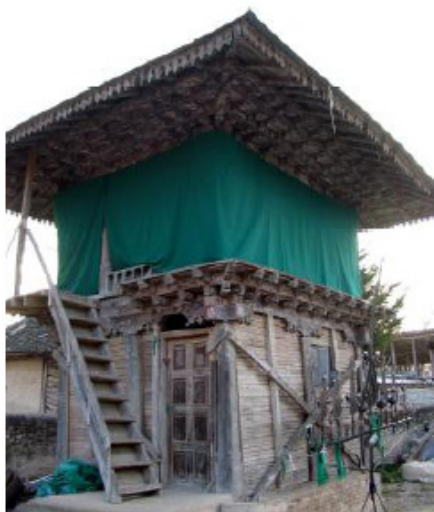
Figure 9. Seyyed Mahale Shia Deh in Babol city

It is located in Seyyed Mahale Shia Deh village in Babol (Fig. 9). It is approximately 3×2.5 m in length and width. The two-storey monument has been made of wood and has gabled ceiling with wood work. The ground floor of this building is surrounded by wood on four sides and is different from common kinds that are open in all four sides.