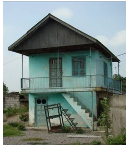
Figure 7. Tamesk Saqanefar in Amol city

It is located in Tamesk village in Amol (Fig. 7). That is 6×6 m in length and width .it is a Two-storey building the same as other saqanefars in the area. The difference is that the whole building has been made of brick.