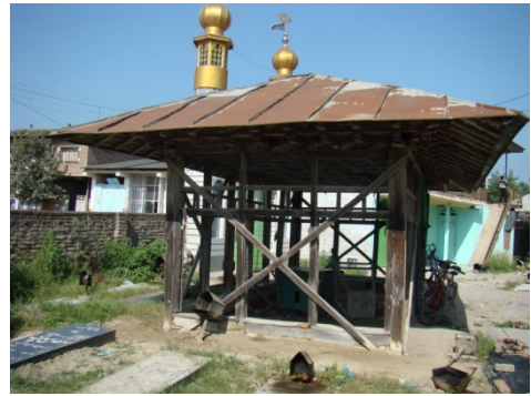
Figure 14. Western Pasha Kola Saqanefar in Amol city

other exceptions in Saqanefar architecture of the region. It is worth noting all kind of Saqanefar has same religious function.