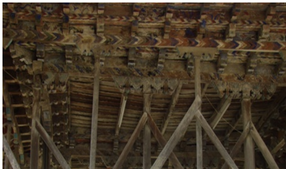
Figure 18. wood work and painting on wood, Pasha Kola Saqanefar, Amol city

Technique and decoration motifs in Saqanefars are also diverse and unique. Wood work, woodcarving and painting on wood (figures 18 and 19) are famous decorative techniques in the buildings and motifs and afterlife (fig. No. 21)[20], religious (Fig. 21), mythical (Fig. 22) themes are the most important decorative motifs of the buildings.