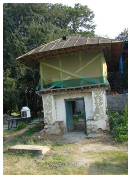
Figure 2. Kom Dareh Saqanefar in Amol city

This Saqanefar is located in the south of Kom Dareh village in Amol city (Figure 2). It is approximately 4×3.5 m in length and width. The building has two floors. The First floor is made of mud and bricks and the second floor of wood. It has a gabled ceiling. Wood work and wood carving techniques on ceiling and plaster painting with plant motifs are decorations of the Saqanefar.