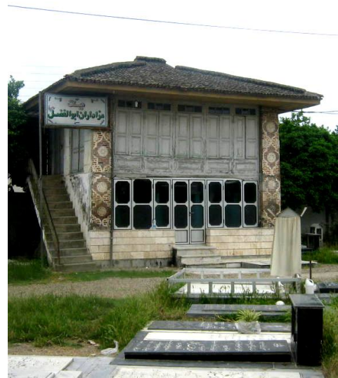
Figure 10. Kija Tekiye Saqanefar in Babol city

The Saqanefar is located in Babol city (Figure 10). It is 5×4 m in length and width. It is a two-story building, and is entirely made of brick. Wood work, wood ornaments and painting on wood is unique in the building. The building has also a gabled ceiling.