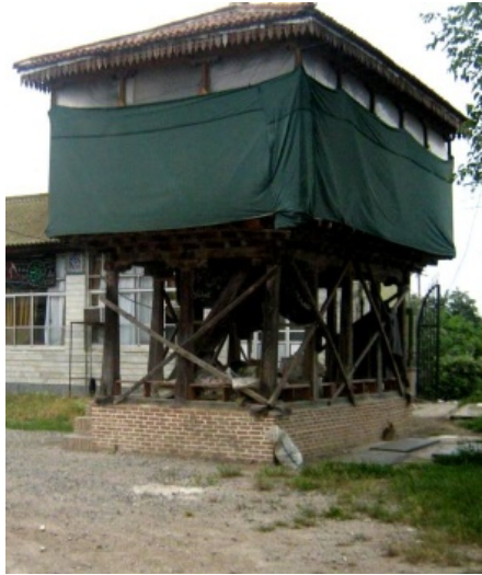
Figure 4. Najar Mahale Saqanefar in Amol city

This Saqanefar is located in Najar Mahale village in Amol (Figure 4). It is approximately 6×3 m in length and width. It is a two-storey building and is entirely made of wood[13]. Brick and cement are used to a height of approximately 1 m only on the ground floor. Its gable ceiling margin is decorated with wooden work, scolding and painting.