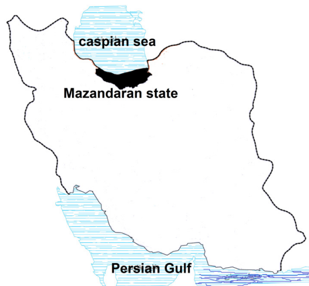
Map 1. the position of Mazandaran province on the map

1- Young high Alborz mountains, 2- low-lying limited northern plains which are placed Between Alborz Mountains and the Caspian Sea, 3- Mazandaran foothills[11]. Due to the architectural similarity between Saqanefars, 13 unique monuments have been chosen as samples among countless saqanefars of the area to be studied in this research. The monuments are in central Mazandaran (that are Amol and Babol), so most of the introduced examples are in Amol and Babol cities. (Map 2).