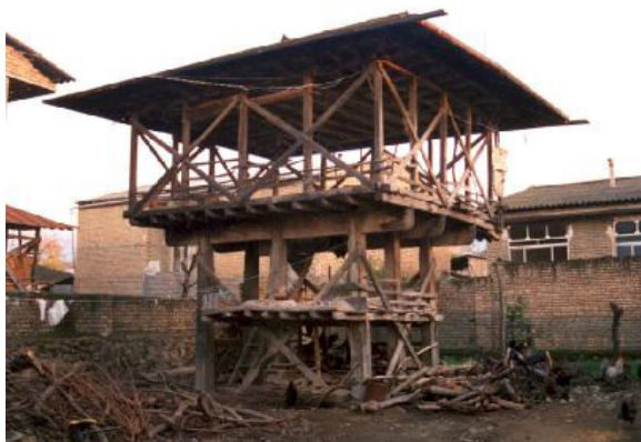
Figure 13. Ketī late Saqanefar in Shirgah city

This building is located in Ketī village in Shirgah city (Fig. 13)[17]. It is a two-story building and is entirely made of wood. The ground floor is smaller than the top floor and its length and width is approximately 2×3 meters. The ground floor of this building is divided into two parts and has made a three floor building which is unique in its kind. It is different from the other types in the region. Like other Saqanefars wood work, wood carving and painting on wood is seen at the margins of the gabled ceiling.