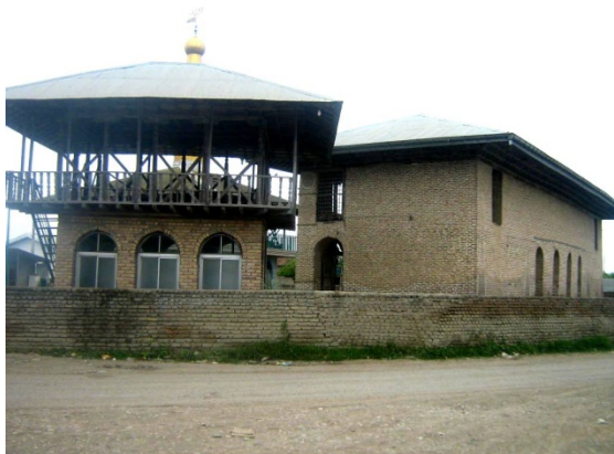
Figure 12. Bizaki Saqanefar in Jouybar city

windows have been installed in the building. The second floor is made of wood. The ceiling is gable, wood work and wood ornaments can be seen on the ceiling.