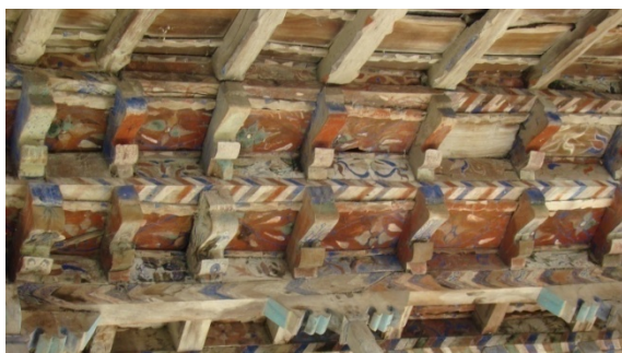
Figure 19. wood work and painting on wood, Hendu kola Saqanefar, Amol city