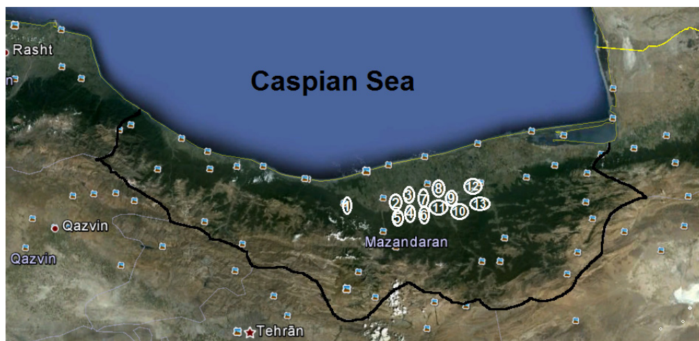
Map 2. approximate display of introduced locations on the Google Earth map