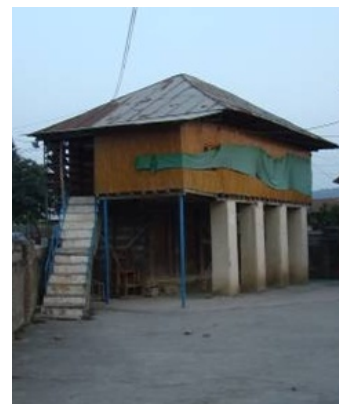
Figures 17. Western Darka Posht Saqanefar in Amol city