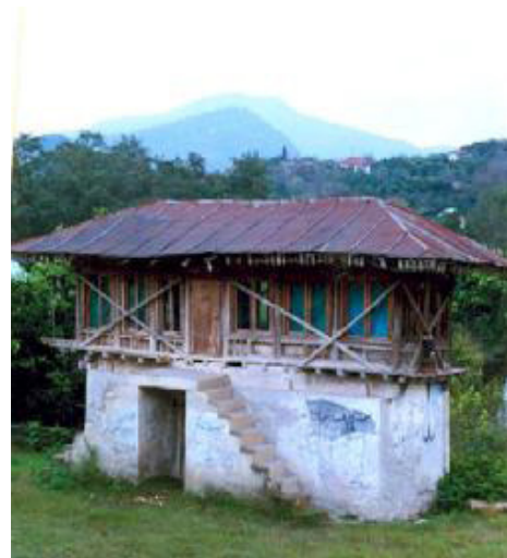
Figure 11. Gavan Kola Saqanefar, Babol city

It is located in Gavan Kola village in Babol city. (Fig. 11)[16] its length and width is 4×3.5 m. it is a two-storey and is made of wood. Around the building is blocked by tent. It also has a gabled ceiling and wood work and wood ornaments have been used there.