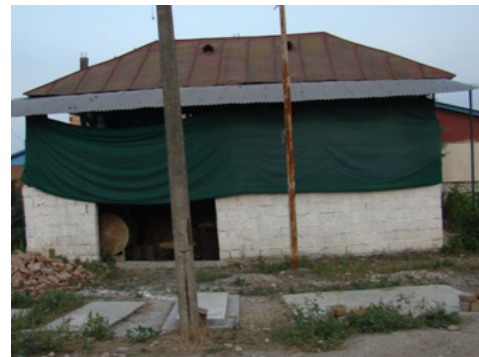
Figure 15. Western Kom Dare Saqanefar in Amol city