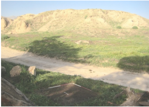
Plate 2. The location of TT.N12

In the course of this season's excavation, an accompanied burial was found in test pit number 12 in the depth of 200 cm from the mound surface.