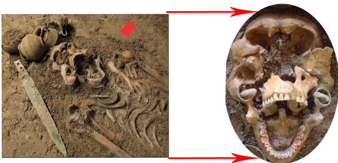
Plate 4. Certain funerary tradition in Tapeh Giyan, the rings put on the two papillae on the lower jaw joint

Giyan-type pottery is under the influence of that of Susiana D and the Elamite painted pottery in Khuzestan and Suse, and the final phase of Giyan IV pottery dates back to late second millennium B.C. and after that, Giyan III pottery form- from the graves of Tapeh Giyan, Tapeh Jamshidi, and Tapeh Godin III- is observed[21]. Considering the existence of metal artifacts in our subject grave (grave 123), we could understand that this sturdy alloy is protean and malleable, and was first formed by molding technique, and then with hammering (both when heated and cold), which all introduce the Bronze Age characteristics (3000-1450 B.C.E).