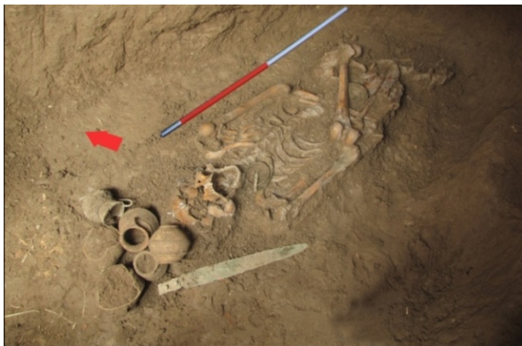
Plate 3. How funerary gifts buried with the skeleton

In this grave, 19 objects have also been found together with the skeleton; this assemblage of objects includes: 6 ceramic pots, 4 bronze pots, 1 bronze spear, 1 bone object, 2 bronze earrings, 2 bronze rings which were joint to the jaws, 1 metal ore-like blade, and 2 bronze rings on elbow bones. These objects which are considered funerary objects and grave gifts were mostly put above skeleton's head and at the same level with the skeleton (pl. 3).