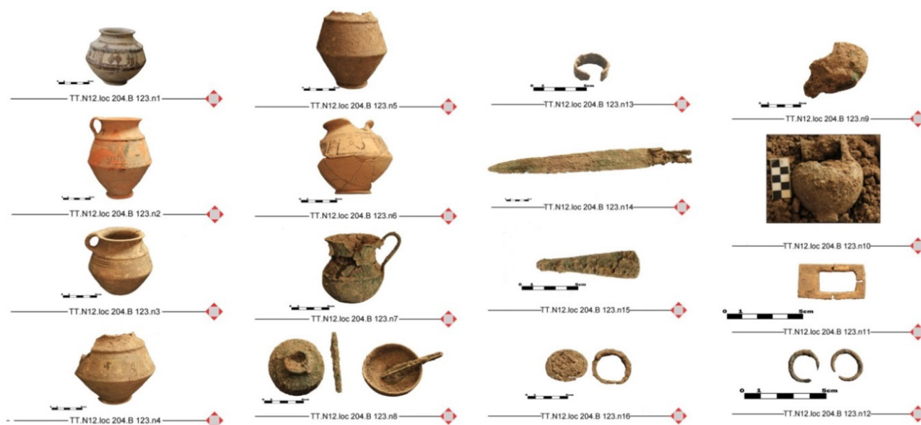
Plate 5. Objects found from the grave (Gifts from the grave)

The notable point about this burial is the skeleton's position pattern; this skeleton's upper part along with its pelvis is both in a complete supine position, and its mouth is unnaturally open (pl. 4, 5). Considering the existence of two bronze rings at the joint of the upper and the lower jaws (mandible and maxilla), we could conclude that some changes have been exerted on the primary status of the burial. The jaw bone and the teeth are completely sound except for the premolars which have traces of wearing on them; all this makes us presume that this person would do an activity with them when he had been alive (pl.5). His legs are tucked in toward his stomach on the right side of his pelvis. The toes and ankles of his both legs were below the right side of pelvis, and the pelvis itself had been dislocated after burial due to external pressures. The bone of left leg's femur was located on the pelvis, and the femur's head had been situated on the right hand's elbow as well (pl. 2).