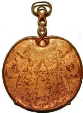
Figure 2. The side of a bronze mirror from Desborough, Northants, England

The skill in breeding horses, which is still alive today thousands years later, in some specific areas of Italy (Tuscany, Cremona, etc..), such skill explains why there had always been a conspicuous presence of representatives of the ordo equester in the Roman Senate. Of course, each new war effort coming from Rome would push the gens Cassia (who provided both the means of transport - chariots and horses – and the manufacture of weapons) to significant and important assignments. Guaranteed revenues paid with public money. Just from the significant presence of many representatives of the ordo equester in the Senate, comes the name of Gallia Togata. Such name was used by old historians to define the northern Italy. But what was the origin of such population so devoted to extraction of metals and breeding of race horses ?