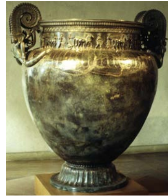
Figure 3. The Vix Kratê

Sculptures and in general representations were of grand and solemn expression, either figures showing rulers or animals or other decorative items.