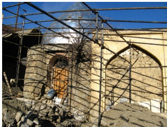
Plate 3. Imamzade Ibrahim Abnik

This offspring of Imam (Imamzadeh) is located at the northwest of Abnik village and in the western side of Kalaroud River and its geographical location is as follows: at latitude of 35 degrees, 59 minutes, and 22.9 seconds and longitude of 51degrees, 36 minutes and 7.59 seconds and height of 2450 meters above sea level. Imamzadeh is situated at the northwestern part of the village. The main materials of the building consist of rubble with stucco and clay mortar which are completely apparent from outside (pl. 3).