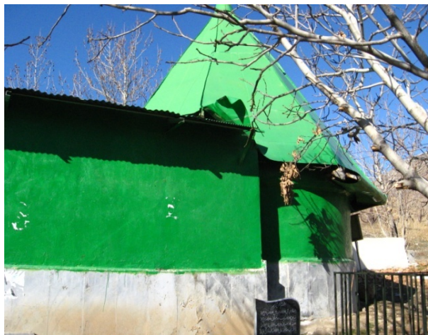
Plate 11. Imamzade Fazl and Fazel e Chahar Bagh