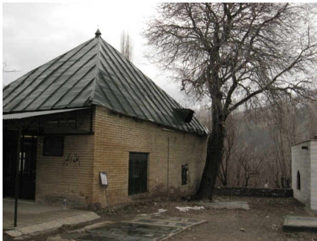
Plate 9. Imamzade Mohammad and Abdollah Boujan

shrine have been originally consisted of stone and stucco mortar and during later periods it has been covered with bricks (pl. 9).