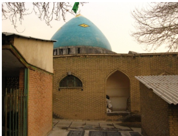
Plate 2. Imamzade FazAli e Nārān, Lavassan town