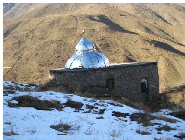
Plate 4. Imamzade Tayyeb Abnik

Its geographical location is: latitude of 35 degrees, 59 minutes and 16.1 seconds and longitude of 51 degrees, 36 minutes and 55.9 seconds (pl. 4).