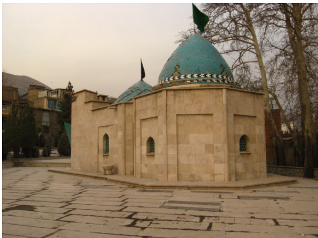
Plate 1. Imam Zadeh Abdollah, Jaeij, Lavassan town