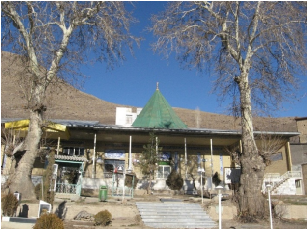
Plate 12. Imamzade Khajeh Soltan Ahmad