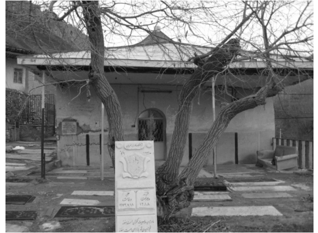
Plate 7. Imambade Mohammad Shoeib Kond e Sofla

Its geographical location is as follows: an latitude of 35 degrees, 51 minutes, and 52.9 seconds and longitude of 51 degrees, 38 minutes and 51.9 seconds and is situated on the height of 1992 meters from sea level. Materials of the building include rubble, stones from the bottom of the river and traditional stucco mortar (pl. 7).