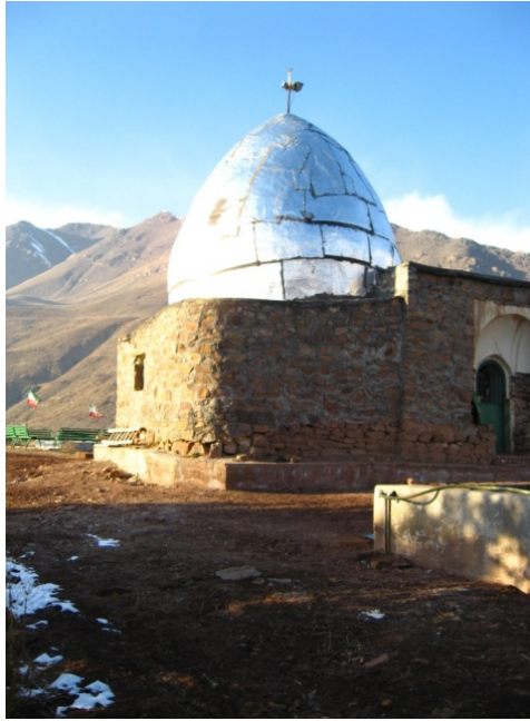
Plate 5. Imambade Mousa Abnik