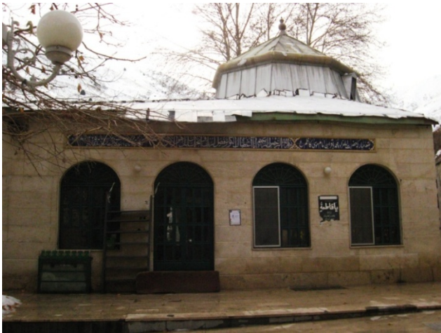
Plate 6. Imambade Mohammad Bagher Roudak

This monument is situated on the southern end (upper part) of the village and in the western angle of Ziarat valley in geographical location of 35 degrees, 50 minutes, and 49.1 seconds of latitude and 51 degrees, 32 minutes and 51.8 seconds of longitude and at the height of 1869 meters above sea level. Apparently, the main materials of the building consist of rubble and traditional mortar of stucco. Today, all parts of the building including interior and exterior parts are covered with new materials (pl. 6).