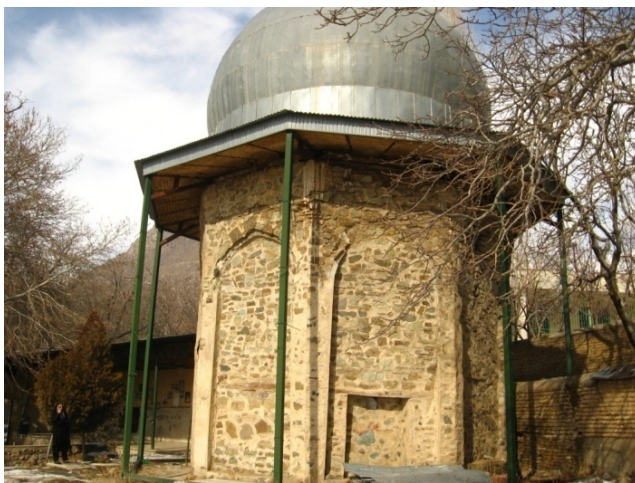
Plate 13. Imamzade Younes