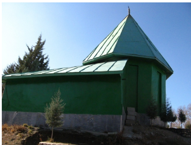
Plate 10. Imamzade Tayyeb e Rassanān

Is situated at the center of the village and besides a hill which is called Dezvareh hill by the indigenous people. On some graves existing beside the shrine, Dezvarei surname is observed. Its geographical location includes: an latitude of 35 degrees, 48 minutes, and 11.3 seconds and a longitude of 51 degrees, 45 minutes and 23.1 seconds and height of 1945 meters from the sea level. The main materials of the building include stone and mortar and materials of the joint building consist of brick and cement (pl. 10).