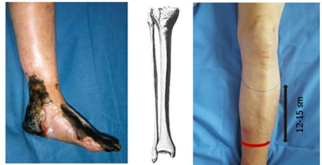
Figure 1. The local status of the patient and the level of amputation of the leg

The operative field is processed in the standard way: 3-fold treatment with betadine and alcohol (70 °C). A semilunar incision of the upper middle part of the anterior surface of the tibia was performed, creating an anterior (4 cm) and posterior flap (16 cm), including the skin, subcutaneous tissue and the fascia of the tibia itself, so that their length will allow covering the stump with a free skin flap (Fig. 1). Next, a resection of the tibia bone was performed using a Gigue saw at 13 cm below the knee cleft with preservation of the nutritive artery (a. nutriticum) and resection of the fibula was performed 2.5 cm proximal to the tibia, followed by ligation of the lower leg vessels and nerves.