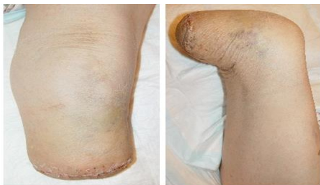
Figure 3. The appearance of the stump (after 18 days)

Next, suturing the calf muscle to the anterior flap with the closure of the tibia and suturing the skin-fascial flap. Aseptic pressure bandage. Smooth postoperative course. The drain tube was removed on the 2 nd day after surgery. The patient was discharged from the clinic on 27/10/2021. Removal of sutures on the 14th day (Fig. 3).