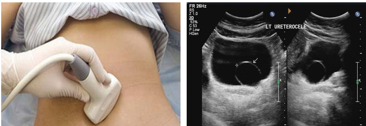
Figure 2. Exosonography examination. Solitary intravesical ureterocele