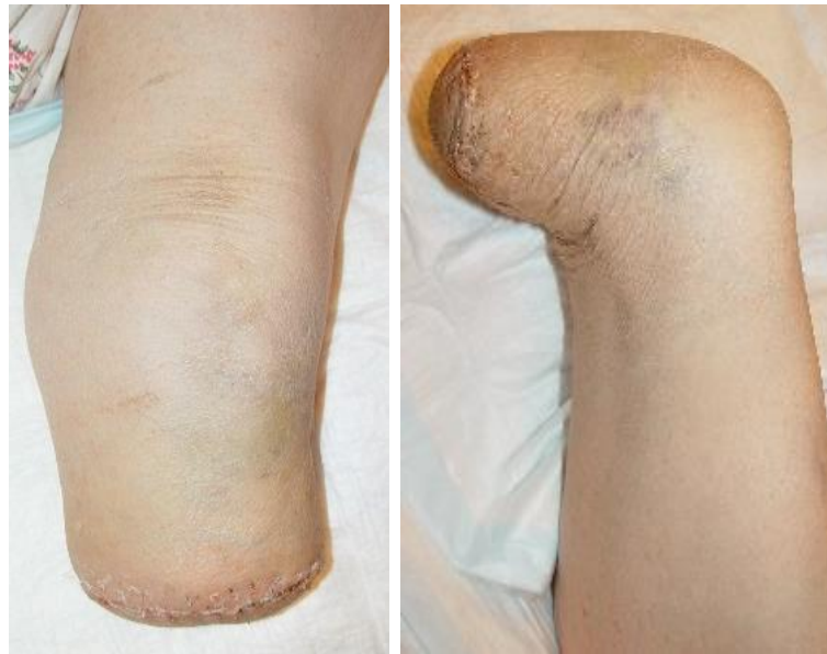
Figure 3. Appearance of the stump (after 18 days)