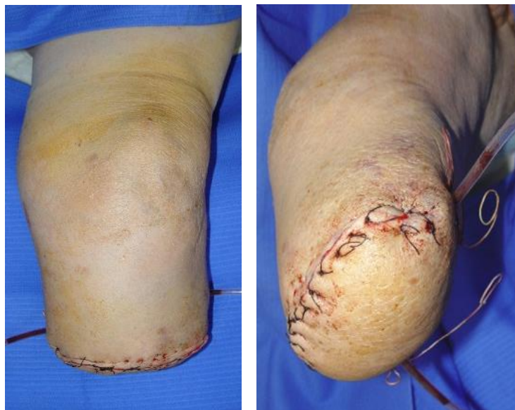
Figure 2. Postoperative view of the leg stump