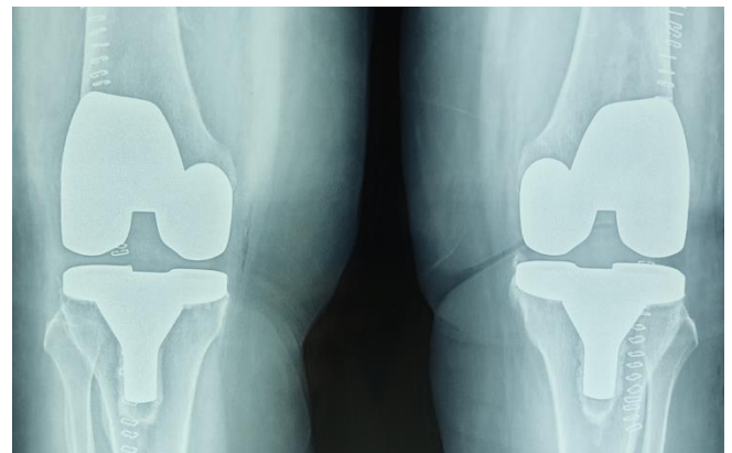
Figure 3. The same patient after TKE (Total knee arthroplasty)