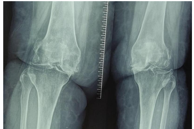
Figure 2. Patient S., female, born in 1965. Radiography of the knee in direct and lateral projection before surgery (osteoporosis, knee deformity)

the thigh which played a major role in the restoration of the SDF after surgery. The tension of the following muscles was checked: m.m. vastus medialis, lateralis and rectus, medial muscle group m. semimembranosus, muscle group m. biceps, as well as shin muscles m.m. tibialis anterior, gastrocnemius on both sides of both damaged and healthy legs synchronously.