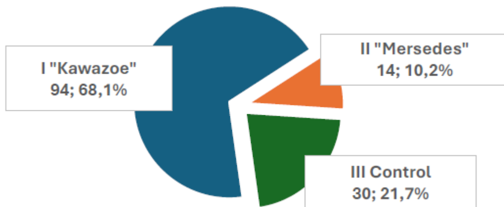
Figure 1. Distribution of patients by groups

In Group I, postoperative complications occurred in 26 patients (27.7%), while 68 patients (72.3%) had an uneventful recovery. In Group II, complications were observed in 4 patients (28.6%), whereas 10 patients (71.4%) had no complications. The highest rate of complications was recorded in the control group – 26 patients (86.6%), while only 4 patients (13.3%) had an uncomplicated postoperative course.