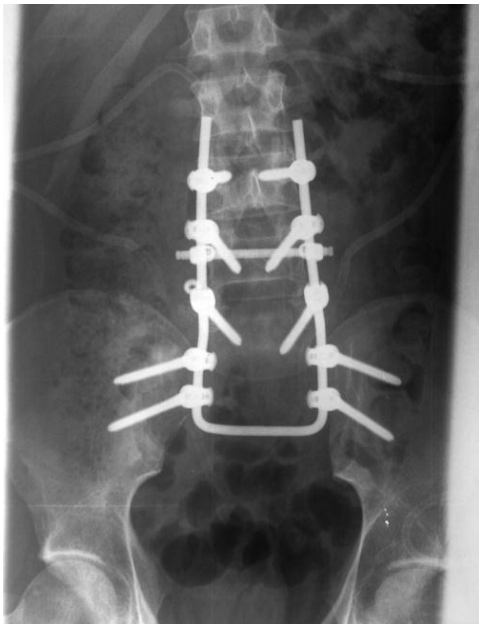
Figure 4. Postoperative X-ray of the patient after lumbo-pelvio fixation

In group 1, all tumors were removed totally by a block. After the operation, all patients underwent a control MSCT and X-ray examination.