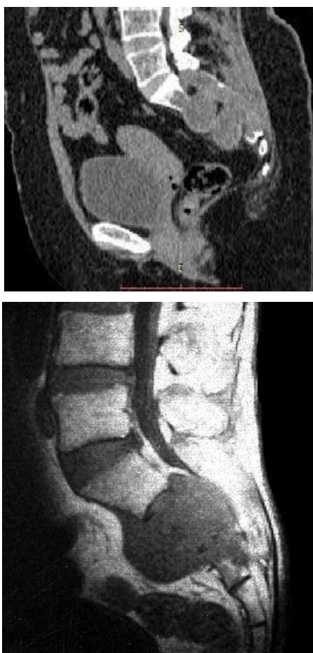
Figure 1-2. MSCT, MRI of a tumor lesion of the sacral vertebrae

The earliest symptom of sacral tumors was local pain in the sacral region. With the progression of the tumor, root symptoms appeared. With compression of the SI roots, typical manifestations of sciatica, SII–SIV roots, pelvic organ disorders occurred, in far advanced stages, radiculopathy of all sacral roots (SI–SV), pronounced root pain were typical. On a 5-point scale in group 1, radicular pain syndrome averaged 2.3 points, sensory radicular disorders 3.1 points, motor radicular disorders 3 points; on a 3-point scale, pelvic disorders before surgery averaged 2.2 points. In group 2, radicular pain syndrome was 2.5 points, sensory radicular disorders 3.3 points, motor radicular disorders 3.4 points; on a 3-point scale before surgery, pelvic disorders averaged 2.1 points.