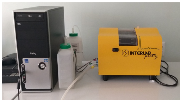
Figure 1. Semi-automatic device for electrophoresis of blood plasma proteins "Interlab Pretty"

The immunochemical method was used to determine the type and amount of immunoglobulin heavy (IgG, A and rare types) and light chains ( \kappa , \lambda ) and free chains ( \kappa , \lambda ) in blood serum by immunofixation of pathological monoclonal immunoglobulin and electrophoresis was determined with the help of the automated system "InterlabPretty" (Interlab, Italy) using reagents of the same company before treatment, after each course and after 3 courses of therapy (Fig. 1).