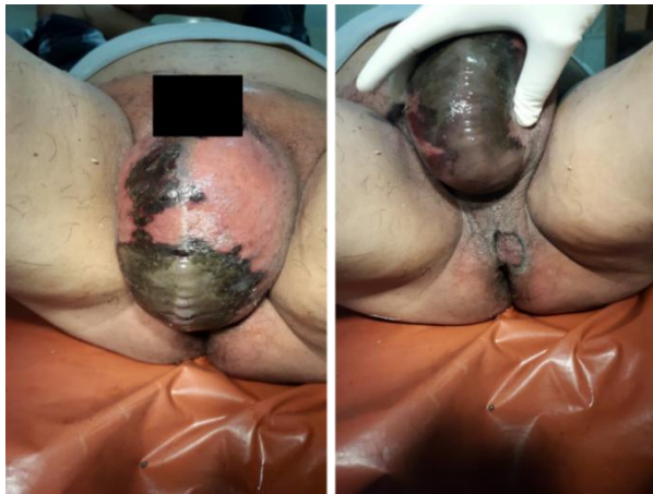
Figure 1. Condition of scrotum and perineum on admission

Blood analysis: Hb - 123 g/l, Erythrocyte - 3.3 \times 10^{12} , Leukocyte - 28 \times 10^9 , stab neutrophils- 11, segmented neutrophils- 86, ESR-19, blood glucose level - 11.5 mmol/l. Urea - 9.5 \mu\text{mol/l} , kreatinine - 128.7 mmol/l. Fibrinogen - 788. BFT- start: 4-50- end: 5-50.