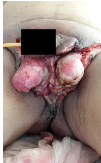
Figure 2. Condition after surgery (3 rd day)

The patient received infusion therapy and subsequently underwent an emergency dissection of a scrotal phlegmon with neurectomy after a brief period of preparation, as depicted in Figure 2. During the surgical intervention, it was observed that the anaerobic purulent process had advanced into the left inguinal area, which prompted the opening of the affected region. During the initial sanitation of the pathological focus, our team consistently prioritized the preservation of the testicles, despite the significant putrefactive process affecting the surrounding membranes. This decision was made due to the potential negative impact on the patient's quality of life during the postoperative period if the testicles were removed, which can result in a dyshormonal state.