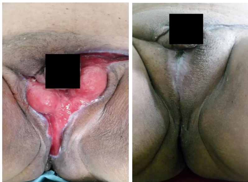
Figure 4. Phase 3 of the wound process (32nd postoperative day) and outcome (64th day)

During the postoperative phase, the patient received routine wound cleansing using antiseptics and the application of ointment dressings to promote tissue healing. The patient was released on the 10 th -day post-surgery and deemed fit for outpatient care at their place of residence. Their condition was reported to be satisfactory. The wound observed after surgery did not exhibit any indications or manifestations of granulation, as depicted in Figure 3.