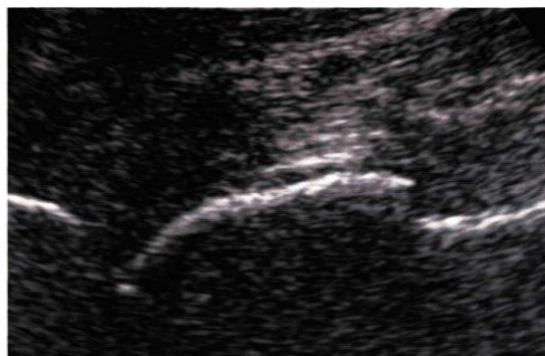
Figure 2. Sonogram of the hip joint with coxarthrosis (significantly flattened shape of the head)

All patients with stages I-III of coxarthrosis showed significant differences in the shape of the head of the hip joint, so if at stage I of the disease almost all (96%) of the examined patients had a spherical shape of the head, then at stage II of the disease only in 58% of cases a spherical shape was detected, and in 42% of cases - a moderately flattened shape of the head. At stage III, this sign increased and in 96% of cases it was found to be significantly flattened (Fig. 2).