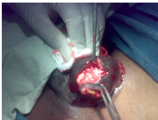
Figure 3. Excision of the scrotal ulcer prior to removal of the testicular tumor

The typical presentation in testicular seminoma is a male aged 15-35 years presents with a painless testicular lump that has been noticeable for several days to months, the patients commonly have abnormal findings on semen analysis at presentation, and they may be subfertile [2] and sometimes presented with hydrocele, and scrotal ultrasonography may identify a nonpalpable testis tumor. Some cases of seminoma can present as a primary tumor outside the testis, most commonly in the mediastinum [3]. The preferred treatment for most forms of stage 1 seminoma is active surveillance.