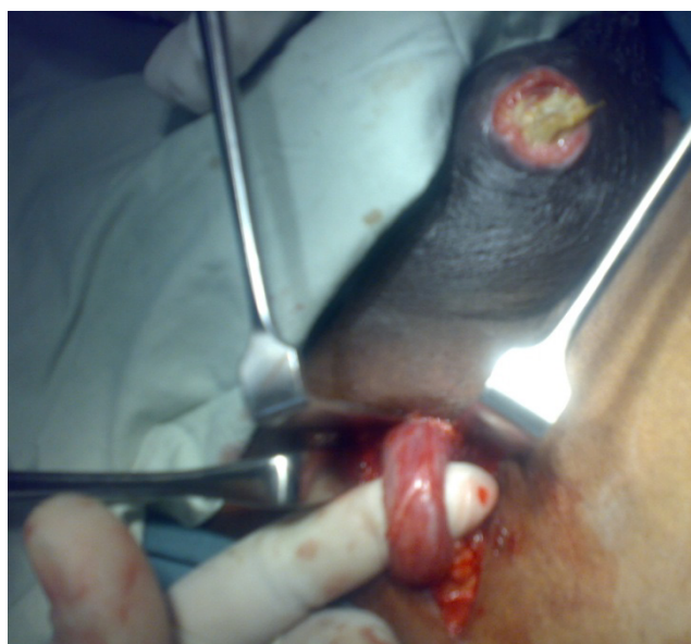
Figure 2. Spermatic cord of the swollen testes

alpha-fetoprotein (AFP) is within the reference range (Figures 1-6). Seminomas account for one-third of testicular germ cell tumors (GCTs), which are the most common malignancy in men aged 15-35 years [1]. The risk of testis cancer is 10-40 times higher in patients with a history of cryptorchidism; 10% of patients with GCTs have a history of cryptorchidism. Treatment usually requires removal of one testis, but this does not affect fertility or another sexual functioning.