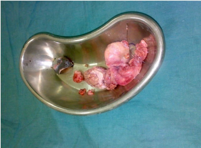
Figure 5. the testicular tumor is totally removed