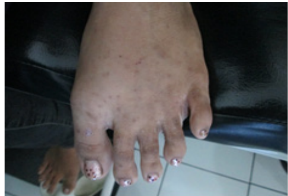
Figure 2. Papules and vesicles located at patient's foot

corporis and prurigo. The diagnosis of scabies is however based primarily on clinical examination. From the physical examination, there were no fine scales found at the skin lesions or hyper pigmentation of the skin.